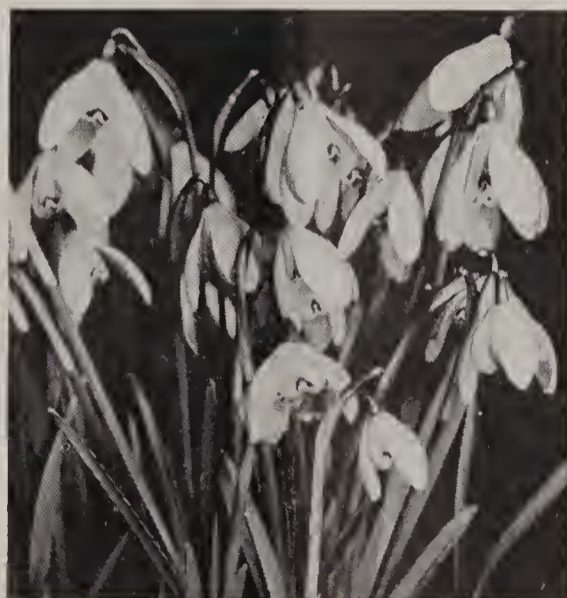
Giant Single Snowdrops

LEUCOJUM aestivum (Spring Snowflake). Very much like the snowdrop, but the flowers are larger and on longer stems, and they bloom later. 75c. per doz., $6 per 100, $50 per 1000